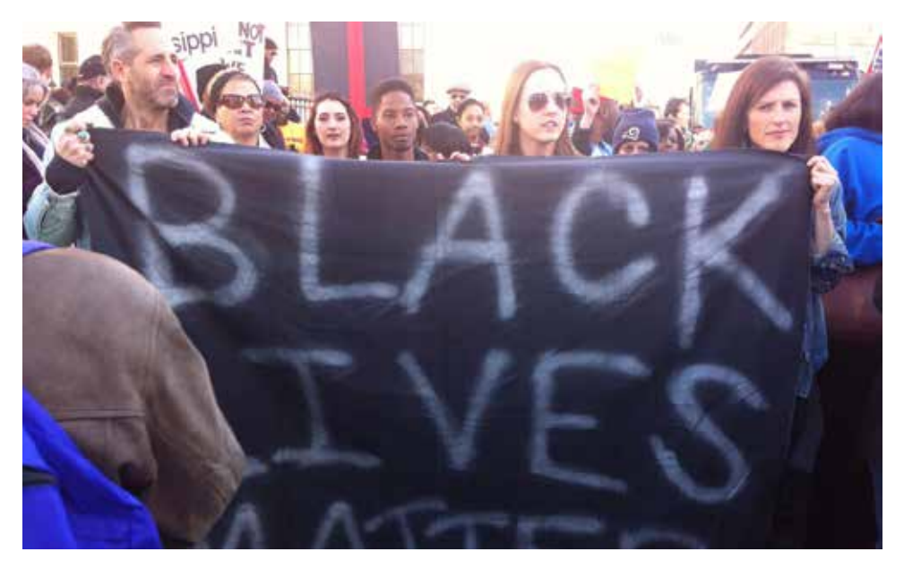
Reclaim MLK march St. Louis, MO.

us do all we can to aid and abet, and join with communities of color in liberation struggle, and do all we can to direct white resentment towards the powerful, while cultivating white solidarity with Black liberation and people of color-led struggles. For disruptive and militant nonviolent direct action in the spirit of the Civil Rights movement (which always focused on the systemic cause of uprisings, rather than the persecution of those initiating them). For multiracial movement building to unite people of all backgrounds for a society organized around the principle that Black lives matter. For an end to structural Black subjugation and premature death as acceptable conditions for capitalist profit and power.