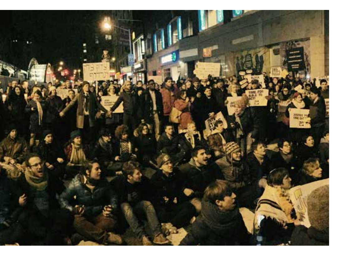
Jewish Leaders and Community Engage in Defiance for BLM.