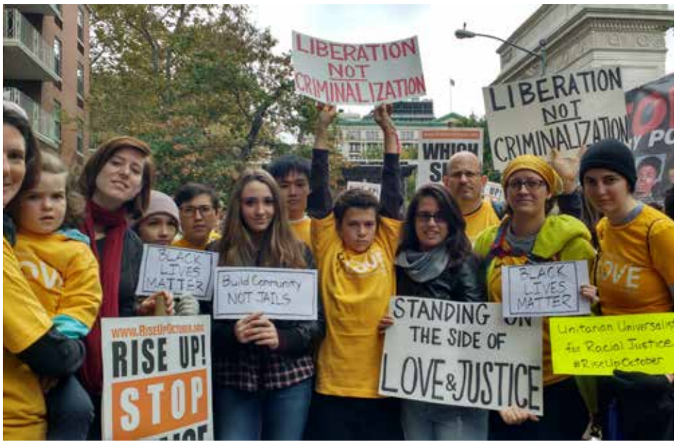
Unitarian Universalists March Against Police Brutality in New York City, NY.

To become an anti-racist faith community, the key question, for a white/white majority community, is not, "How do we get people of color to join our faith community?" it is, "How can we make a prolonged, spiritually-rooted, engaged commitment to uprooting white supremacy within our community and take on-going collective action to challenge it in society?"