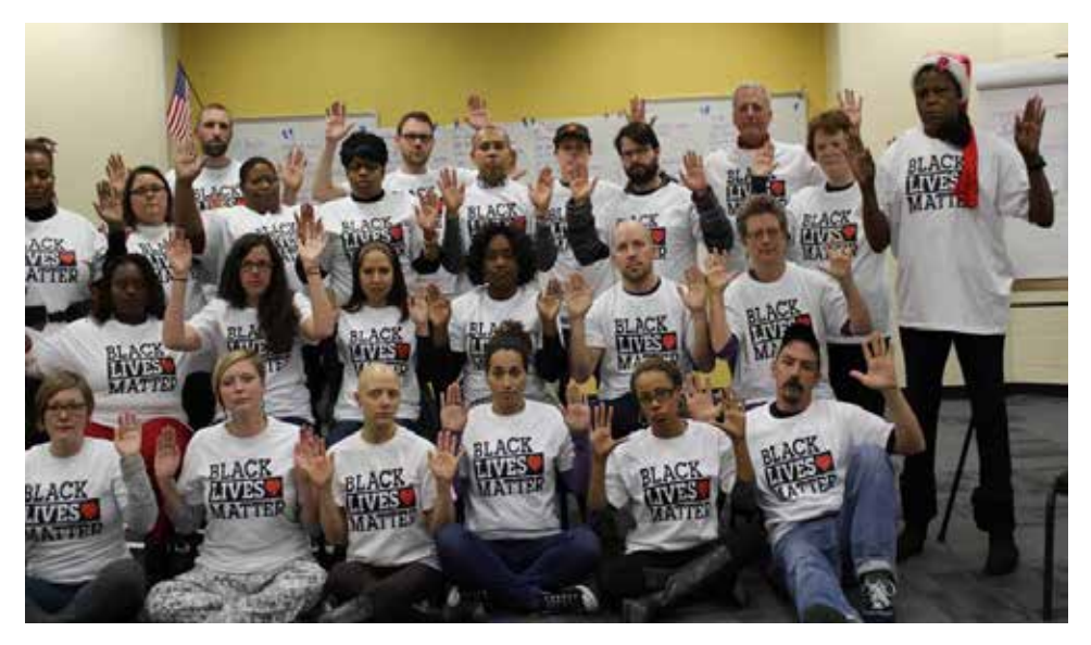
Public School Teachers Organizing in North Carolina.