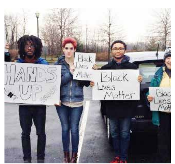
KFTC members rally in Berea, KY.