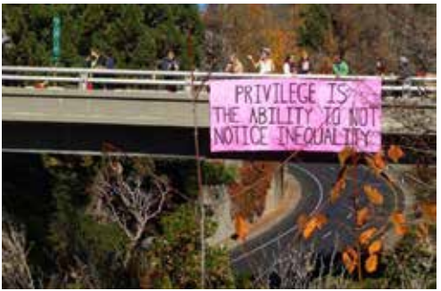
Banner Hang in St. Louis, MO.

Similarly, we have white members in six different towns now organizing right wing radio call-ins (White Silence in the South Still Equals Death: Right Wing Radio Call-In Toolkit available at http://southernersonnewground.org/ radiotoolkit/) as a political intervention after the Emanuel AME Massacre in Charleston. After the massacre, we saw