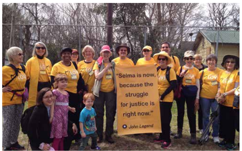
River Road UU Church of Maryland in Selma, AL for 50th Anniversary.

and bringing their spiritual and religious leadership into the streets for marches and civil disobedience.