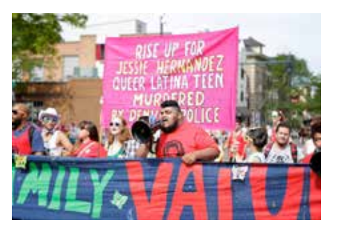
Denver, CO Pride Anti-Police Brutality Contingent.