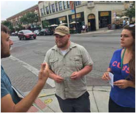
Chicago SURJ Street Team talking with people about BLM.

<sup>44</sup>The Black Lives Matter movement is the leading edge in uniting us for a better world."