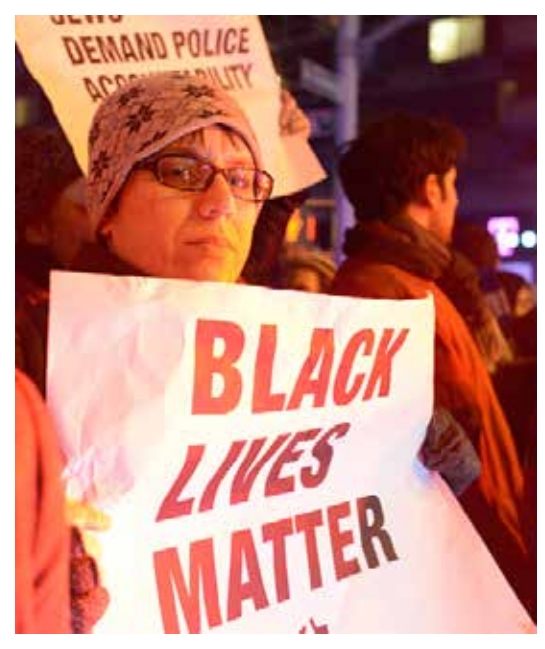
JFREJ Action for Eric Garner.

haphazardly being fit into support roles. We are steadily developing clearer thinking and principles to guide this transformation, and experiencing progress, but we recognize how much we still have to learn and build.