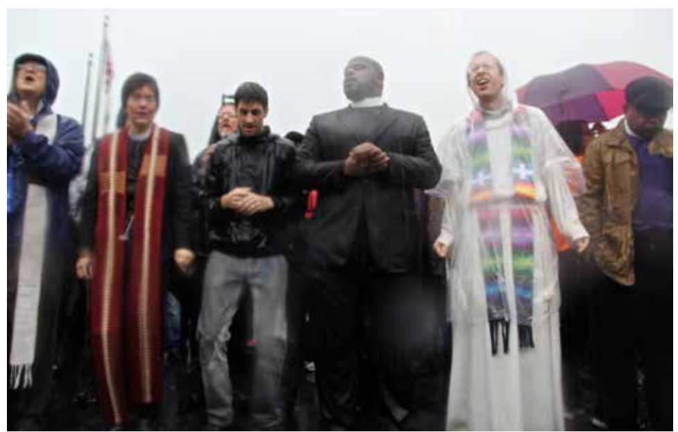
Clergy March in Ferguson, MO.

Love to my beautiful Unitarian Universalist family in Fort Worth who put out a powerful statement on why they stand in solidarity for Black Lives Matter and have committed to replacing their banner, no matter how many times it is vandalized. Love to the hundreds of Unitarian Universalist churches who have also placed banners in highly visible places in front of their churches. As white people of faith, we don't just act in solidarity; we also act to save all of our souls from the monstrosity of white supremacy.