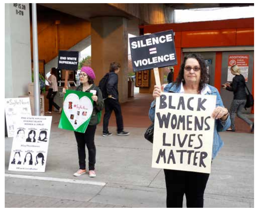
SURJ visibility demonstration during morning commute, Walnut Creek, CA.

3. I need to be more educated/trained to take action: Yes, we need education and yes we need training. AND, we learn so much in the process of taking action,