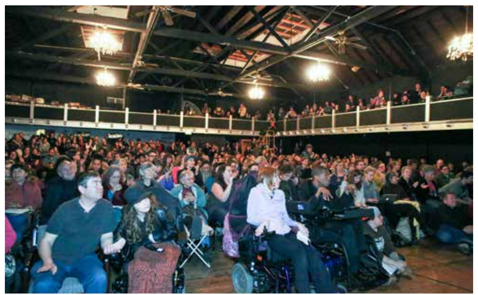
Over 1000 people show up for panel organized by Catalyst Project.

bring other white people with us (not the ones firmly committed to upholding white supremacy, but the people around us who are often quiet in these conversations, on the sidelines, perhaps trying to make sense of what's going on, but don't know where to start—i.e., the people we need to be talking with, building with, and organizing, rather than wasting precious time and energy on Internet trolls).