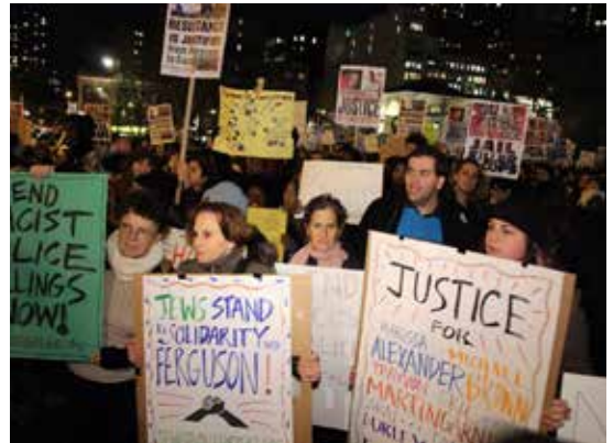
Being A Good Ally Is Not the Goal