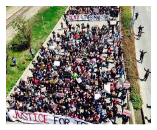
Young, Gifted and Black marches in Madison, WI.

years. Either they have taken a workshop or have been more closely involved in the organization. Similarly, the base building and educational work of groups of color like Freedom Inc. have helped bring a base of leadership and analysis to the current movement moment. Multiple new organizations have grown, contributed, and strengthened over this time period as well.