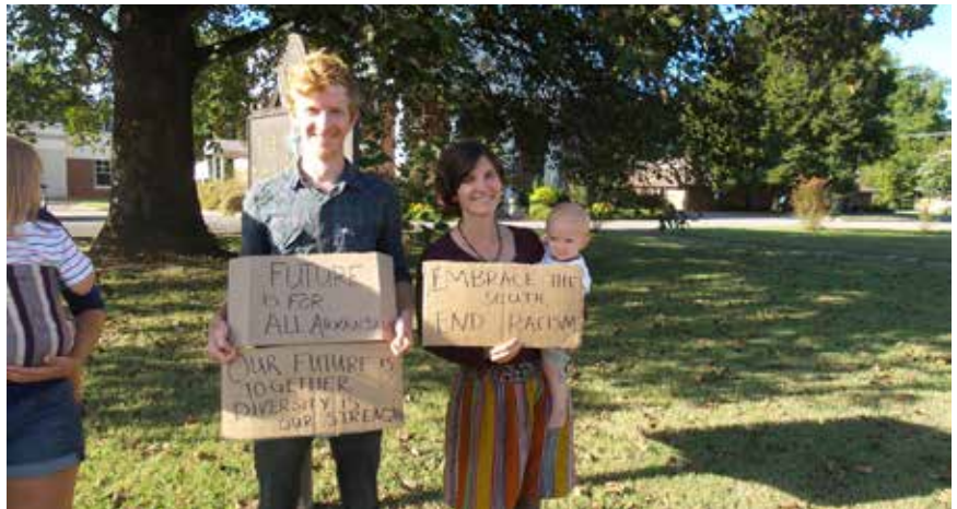
Dardanelle, AR.

But often times people come to me and want to know how they can convince someone in their family who they love, but who they doggedly oppose politically. My response is this is that we need to spend less time trying to move people who aren't moveable and focus our energies on people around us who, in moments like the uprising in Ferguson, are actually moveable. People around us who are asking questions, who