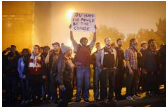
Occupy St. Louis University, MO action.

For multiracial movement-building to unite people of all backgrounds for a society organized around the principle that Black lives matter."