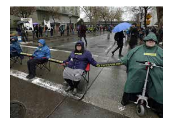
Shutting Down Oakland, CA Police Department.