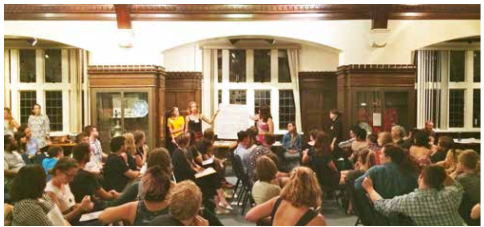
Nashville SURJ First Public General Meeting.

environmental organizations in Alaska contacted us for support. We were able to connect him to an environmental justice organizer in New York state to talk about what folks in other places are doing within the environmental movement to address racism. Creating avenues for local leaders to share what's working, to strategize together, and to draw inspiration from each other helps strengthen all of our work.