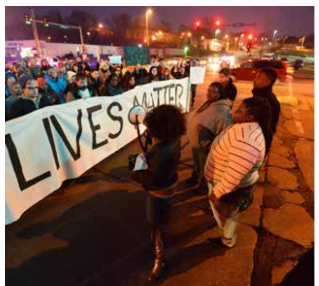
Young, Gifted and Black march in Madison, WI.

YGB is a mostly queer, female, and trans centered group dedicated to ending state violence against Black people through direct action. YGB has centered the myriad ways that state violence affects Black people, and has linked police killings with a fight to stop the building of a new jail in Dane county. State violence in Madison and Dane County is most visible through mass incarceration and vast racial disparities in the local aspects of the prison industrial complex, which are some of the worst in the country.