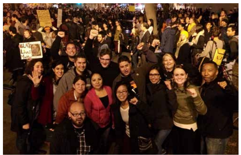
AFSCME Staff at BLM March Oakland, CA.

AFSCME Local 685—was not convinced that there would be adequate funding to address the workload increase that would result from sentencing reform.