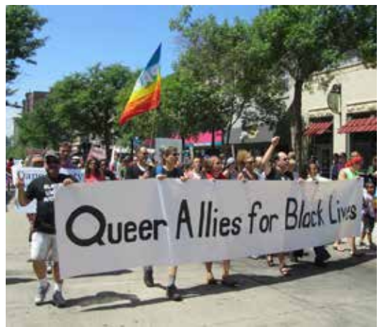
Wisconsin Pride.

up for and work for a world where Black lives matter, a world rooted in collective liberation—a world where we all get free, together.