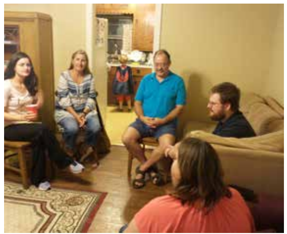
Community Discussion on Racism and Racial Justice at the McElroy House Dardanelle, AR.

You asked about talking points to open these discussions. My suggestion, to help you prepare for the community discussions, is to first have a group conversation amongst yourselves as the leadership/planning team, on what helped open your eyes to these issues—what questions, what conversations really moved you. And then ask: What questions can we ask that will help open this space for conversation, learning, and vulnerability with other white people? And, in these events with