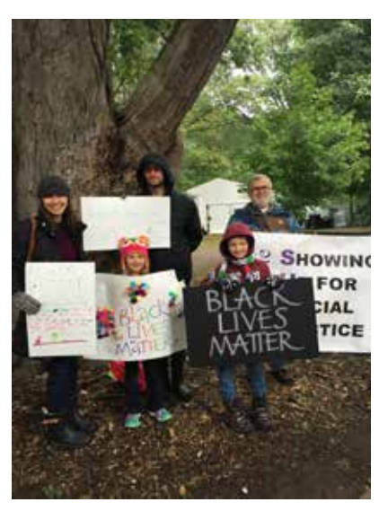
SURJ Families Protest in Louisville, KY.

Third, to help build and nurture my family with liberation values/culture as part of a larger beloved community that loves kids and honors the magic of childhood.