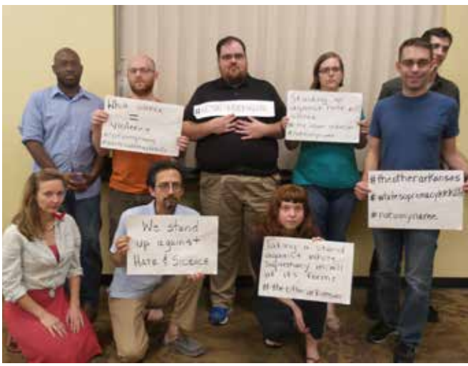
Little Rock, AR Collective Liberation Study Group.

I remember a few years ago, opening my front door and seeing five unfamiliar Black teenage boys on and around my front porch. With my baby in my arm, my initial