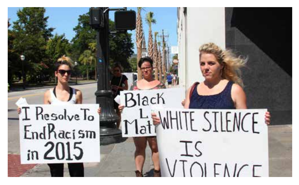
SONG members protest for BLM in Charleston, SC.

The national outrage of Black churches burning and the Charleston massacre where a young white supremacist assassinated women, men, and young people gathered for a prayer meeting—and the national outcry against the Confederate flag growing has brought attention on the South. While many in the North and the West look