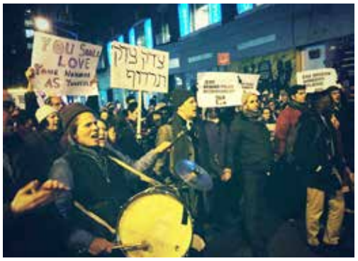
JFREJ Action for Eric Garner.

JFREJ has also been working with our partners to fight against police brutality for nearly two decades, so the recent upsurge in movement work across the city and country is deeply inspiring. In today's fight, we're using multiple tactics that confront the violence of whiteness through the strategic use of public space and media, and the resilient insistence upon cultivating allyship. One effective tactic we recently under-