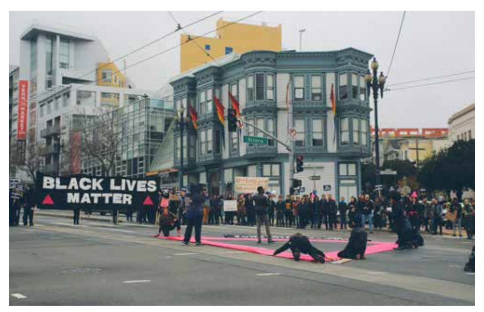
Queers for BLM Direct Action in San Francisco, CA.