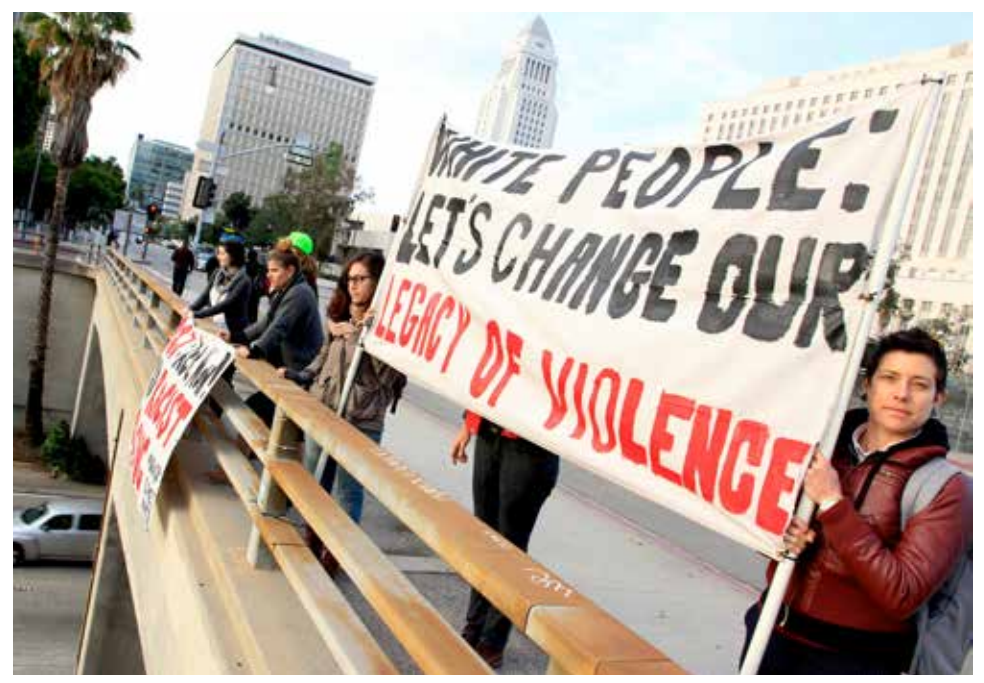
Banner hang in Los Angeles, CA.

For those of us who are white and have been engaged in anti-racist efforts, we need to support other white people to tap into their grief, pain, and sadness about Charleston and turn it into a commitment to the destruction and abolition of institutional racism. No calls for healing disconnected from militant resistance from white people against this brutal racist society. No messages meant to soothe white people's souls, and ease them/us back to sleep. We need messages and leadership to help build the capacity of white people to stay in discomfort, to stay in the dis-ease to truly hear and listen to the voices and experiences of Black people, with the goal of putting raised consciousness into action against racism.