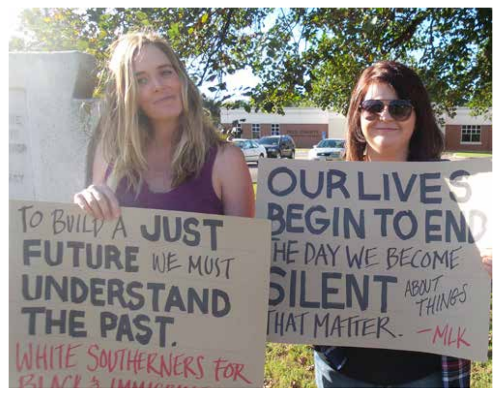
Dardanelle, AR population 4600.

When you leave out challenging the structures of power, then our work against racism and white privilege can very quickly become focused on individual behavior. Without a power analysis, then it can become just about raising awareness, without the larger goal of making structural change. Structural change requires building move-