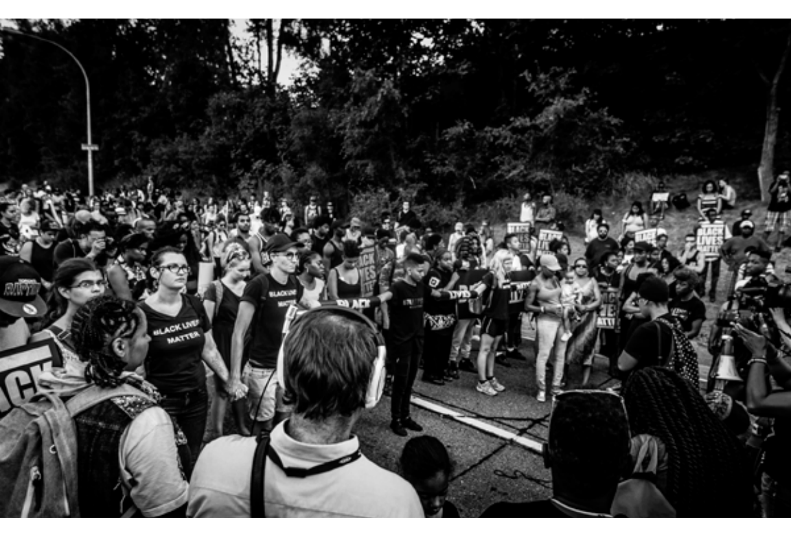
BLM direct action in Toronto, Canada.

But first, why is this a book written by a white person, for white people, when this is about the Black Lives Matter movement? I was radicalized by the Rodney