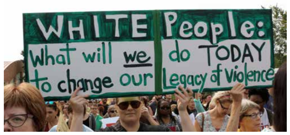
BLM rally at MN State Fair.

Every white person focused on explaining how much they personally like Black people and so therefore racism can't exist needs to take a long hard look at how the shooter clearly had a plan, was methodical, and patiently implemented horrific acts, while ensuring survivors could spread the news of this terrorist attack, to further terrorize the Black community.