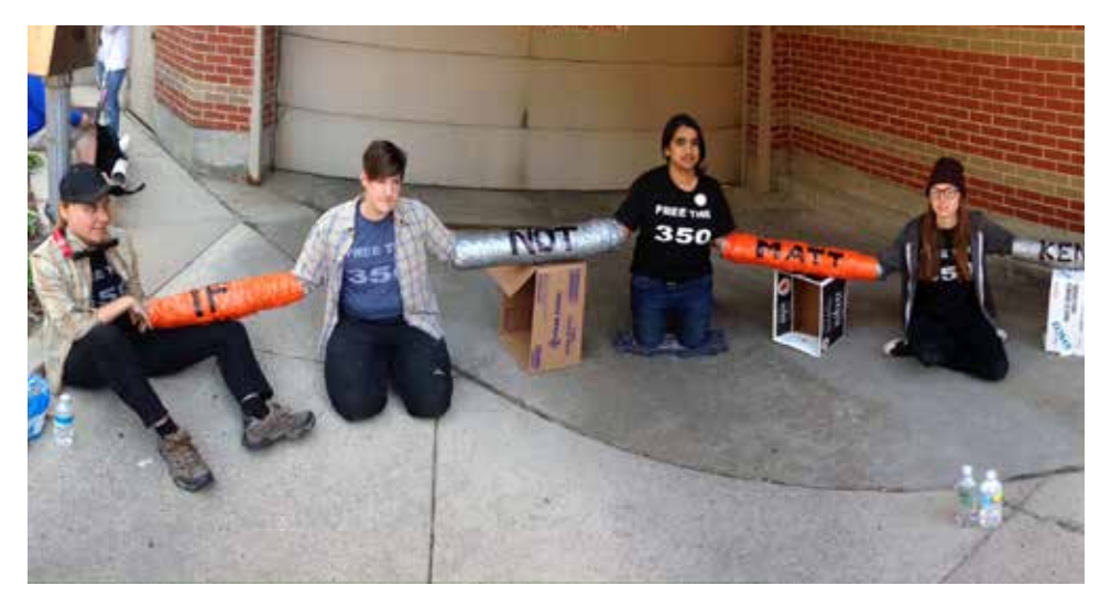
Allies for BLM blockade in Madison, WI.