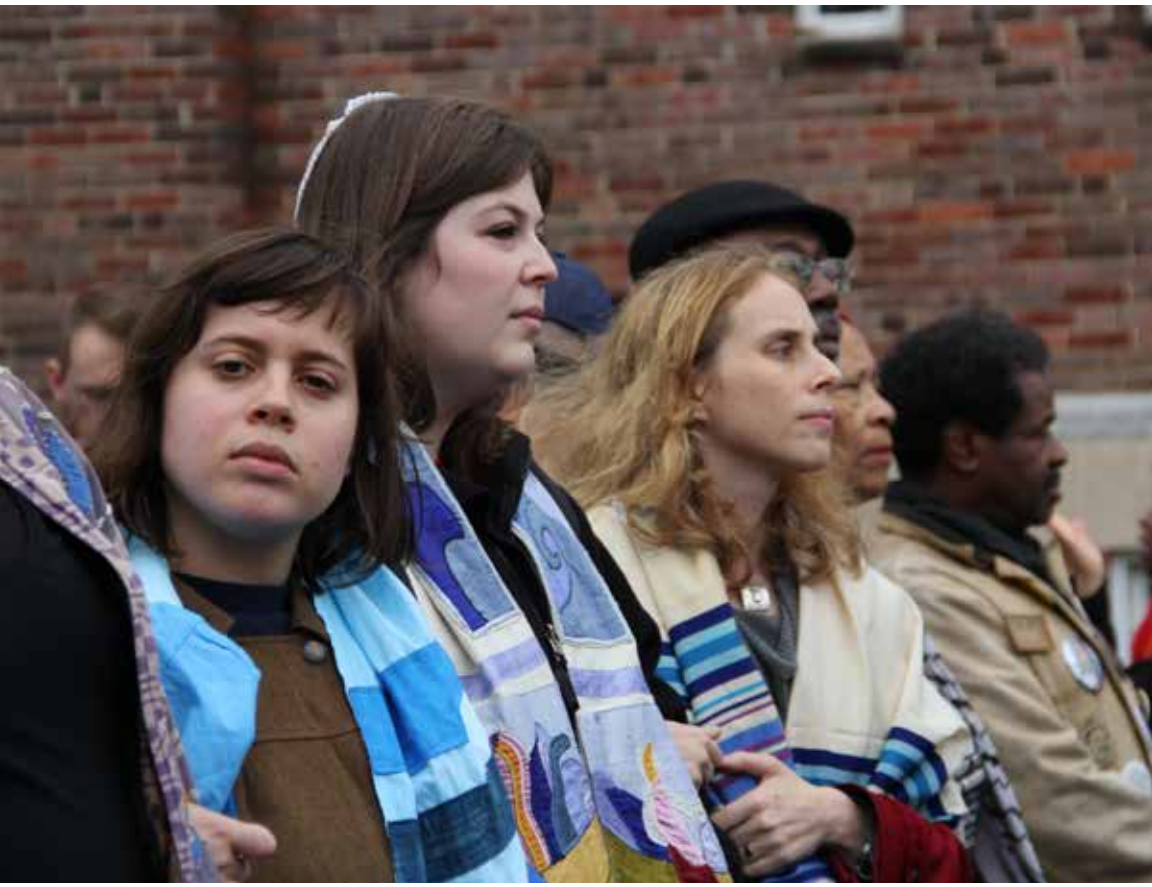
Rabbis and Jewish activists march in Ferguson, MO.

For those of us who are white in the wake of the Charleston Massacre, an atrocity that sparked national outcry in the long history of the racist violence of the United States, it is not the time for us to call for racial tolerance, racial healing, racial dialogue, or racial understanding alone. When white people say these things, even with the best of intentions, the underlying message undermines Black rage. It erases Black pain and Black resistance and serves white people's guilt and grief with vague gestures that do more to confuse rather than clarify both the problem and the solution.