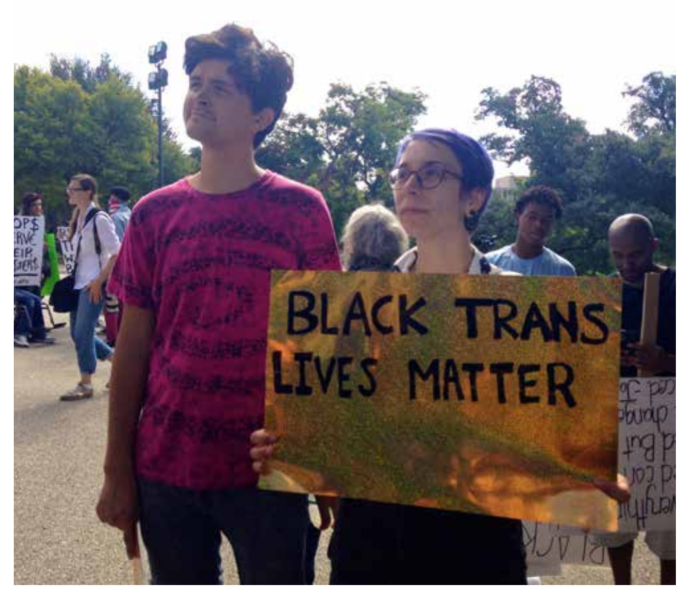
Rally Against Police Brutality at the Texas State Capital.

All Lives Matter is the new "special rights" smear tactic utilized by the White Citizen's Councils and Klan against the Civil Rights movement. Which side are you on? To those who argue "all lives matter," remember, just as we look back on those who declared "Segregation Today, Segregation Tomorrow, Segregation Forever," history will see you.