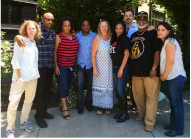
AFSCME Local 3299 Racial Justice Group.

nize our worker leadership and membership to see how the fight for racial justice is part of our fight for economic justice. Ideally, this will make our economic justice campaigns inseparable from campaigns for racial justice at UC, and inspire Local 3299 leadership to actively participate in the BLM movement. A further measure of effectiveness would be our union's ability to collaborate with other