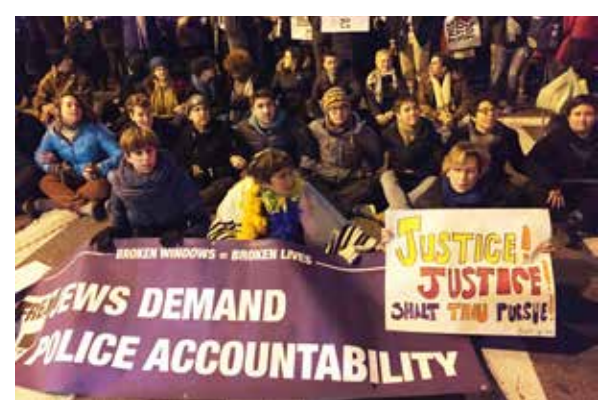
JFREJ Mass Direct Action for Eric Garner, New York City, NY.

Tears ran down my face as I followed the news, often with my three-year-old son nearby, of powerful, defiant, Black-life-affirming, white-supremacist-hegemony-defying marches, vigils, and large-scale direct actions igniting around the country after the Eric Garner non-indictment; and NYC was galvanizing us all. And JFREJ was a powerful force mobilizing a mainly, but not entirely, white Jewish base of members and supporters to be courageous for Black Lives Matter. I've long loved JFREJ, which began in 1990, and has been deeply committed to long-term multiracial organizing and campaigns to build people's power for collective liberation. As their mission statement reads, they are "inspired by Jewish tradition to fight for a sustainable world with an equitable distribution of economic and cultural resources and political power."