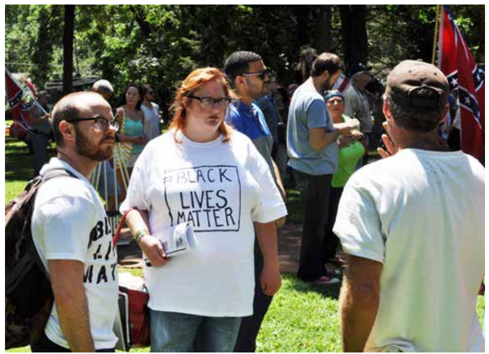
Counter-protest at Confederate Rally in Hillsborough, NC.

That said, my advice is to prioritize building active support with staff who are most receptive, and then other staff who seem open, as well as members and supporters in the broader community who you have affinity with, trying to get as many folks who have organization influence on board as you can, while also having these conversations with your director. To the best of your ability, try to stay in the position of being a leader building up your community's capacity to be awesome for racial justice and try to diminish the possibility of this just becoming an antagonistic relationship between you and your director that gets locked into a dynamic in which neither of you can be your best selves and you can't do the work you want to do.