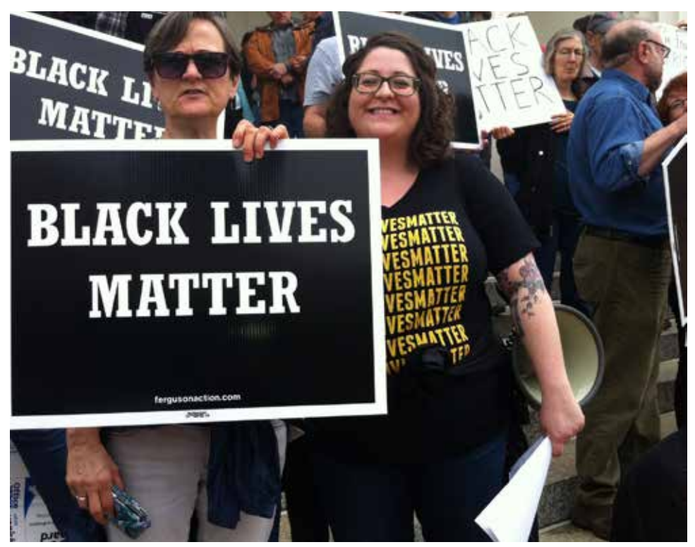
Rally Against the Aryan Brotherhood, St. Louis, MO.

<sup>66</sup>Beloved community isn't born of white hand-wringing but white hands going to work for revolutionary racial justice change."