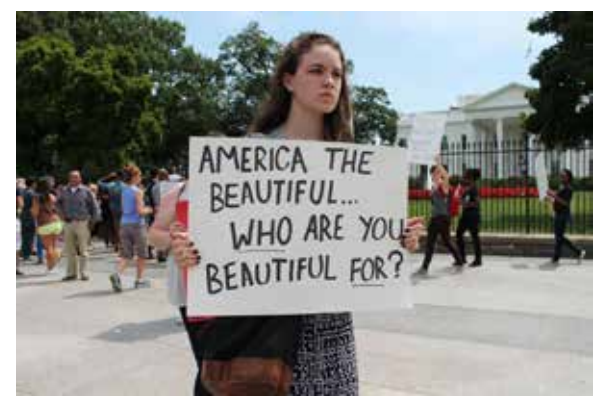
Mike Brown Silent Protest at the White House, Washington D.C.

For all of us who want to move white people into anti-racist consciousness and actions, we must remember the dual role that anti-Black racism plays in disciplining white people to capitalist exploitation. Anti-Black racism was most famously fused into popular culture and ideology through the Blackface minstrel shows. The minstrel show became the national art form by the mid-1800s, and