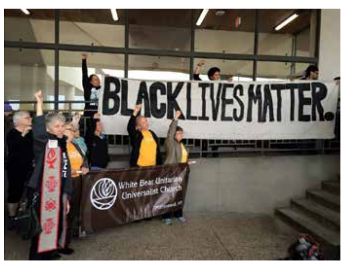
Rally in Minneapolis, MN.

too easy for white people to say, "Racial justice and anti-racism are somebody else's issue, not mine." But when we walk in the world in a way that allows people to enter into our personal stories, to ask us questions, to come closer, to see how they might also see racism and white supremacy as separating them from wholeness and health that they yearn for... People are willing to lean in and risk learning more.