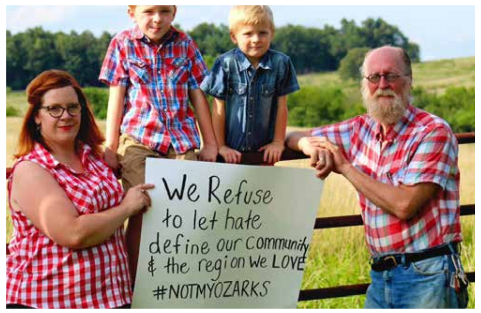
Not My Ozarks anti-racist, anti-Klan campaign.

The more I worked in white communities against racism and for racial justice with a collective liberation vision, the more it became spiritual work. It was spiritual as I began to see and experience the devastation of white supremacy on white communities. I had seen it in my own family, in my Grandfather and in my uncles: the resentment and anger towards Black and Brown communities, anger and resentment that was toxic and ate away at their and other white people's humanity, their sense of justice, safety, and democracy in the world. Now, as a father with two young white boys, I understand anti-racist work as fighting against the monstrosity of white supremacy that steals the lives of Black and Brown children and devours the humanity of white children.