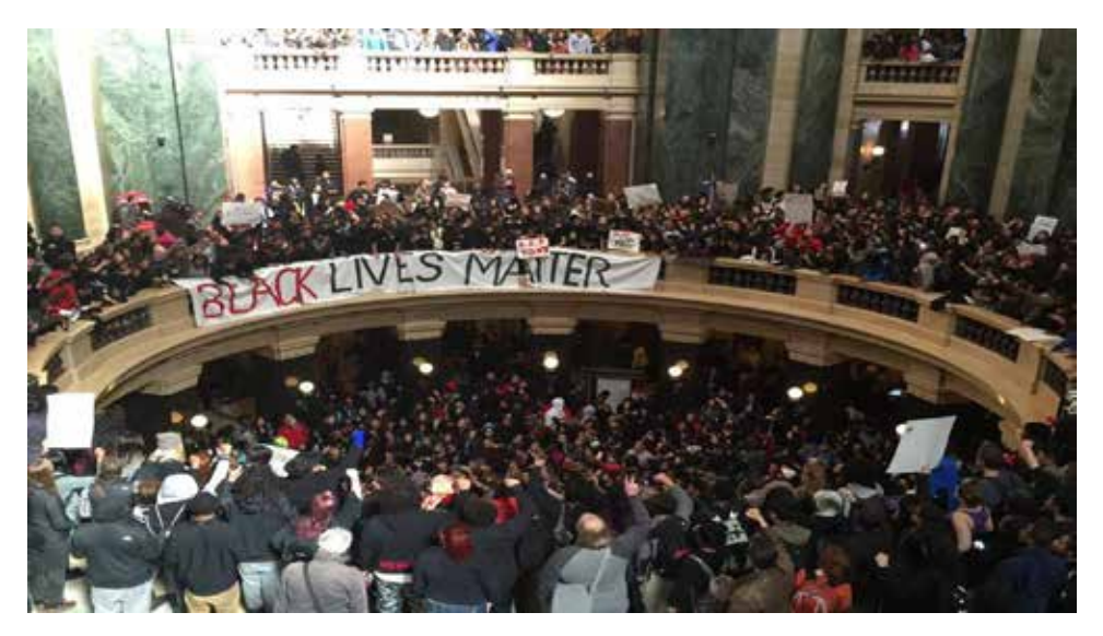
Occupation of Capitol, Madison, WI.

As people racialized as white in a white supremacist society, we must forge new identities rooted in liberation values, and committed to challenging structural oppression. This is the process of unlearning the lies of capitalist individualism and racist fear. This is the process of embracing our shared humanity, creating a just world and building beloved community. When we break white silence that gives consent to racism, we must speak fluently and courageously about a life-affirming culture and society that also uproots capitalism and builds economic justice for all.