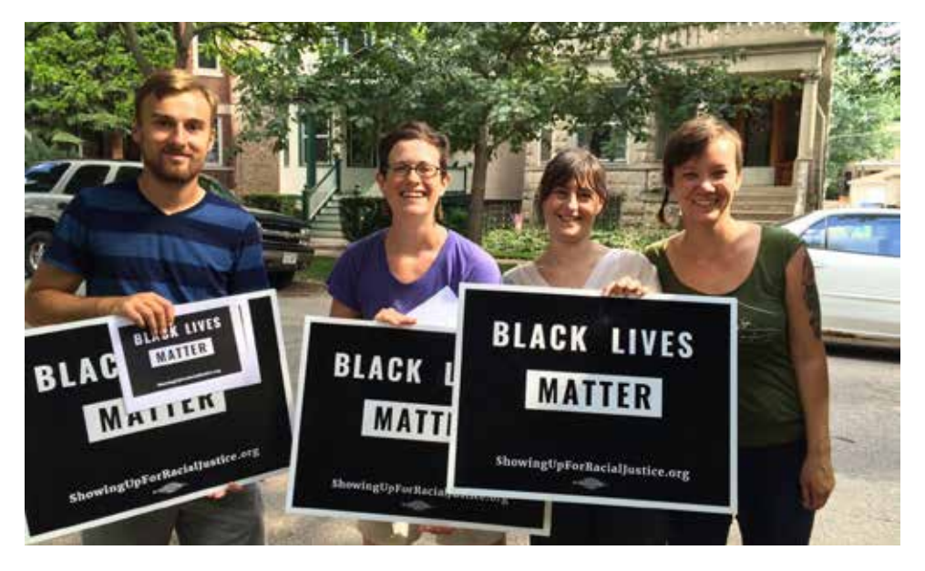
SURJ Door Knocking for BLM in Chicago, IL.

For me it's not about speaking for communities of color, but when it comes to racism, I'm speaking primarily for white communities. I speak out for white kids who I don't want to see grow up in this evil white supremacist system. I speak out for white people, many of us working class folk who have been screwed over generationally by the ruling classes who stoke the flames and encourage white hatred, fear, and resentment of communities of color. I speak out against ruling classes who mobilized white racism to keep both communities of color and white working class poor communities down. I speak out for white communities robbed of the humanity of people of color, while having our own humanity twisted and distorted in the service of mobilizing wealth and power to the 1%.