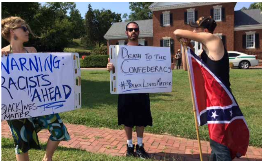
Protesting a Pro-Confederate Flag Rally in Richmond, Virginia.

Every white person who refers to Charleston as "incomprehensible racial tension" (which narrates it as equal people who equally don't like each other, and it's impossible to understand) is providing cover to murderous, historically rooted, structural, and cultural white supremacy that is growing stronger every day.