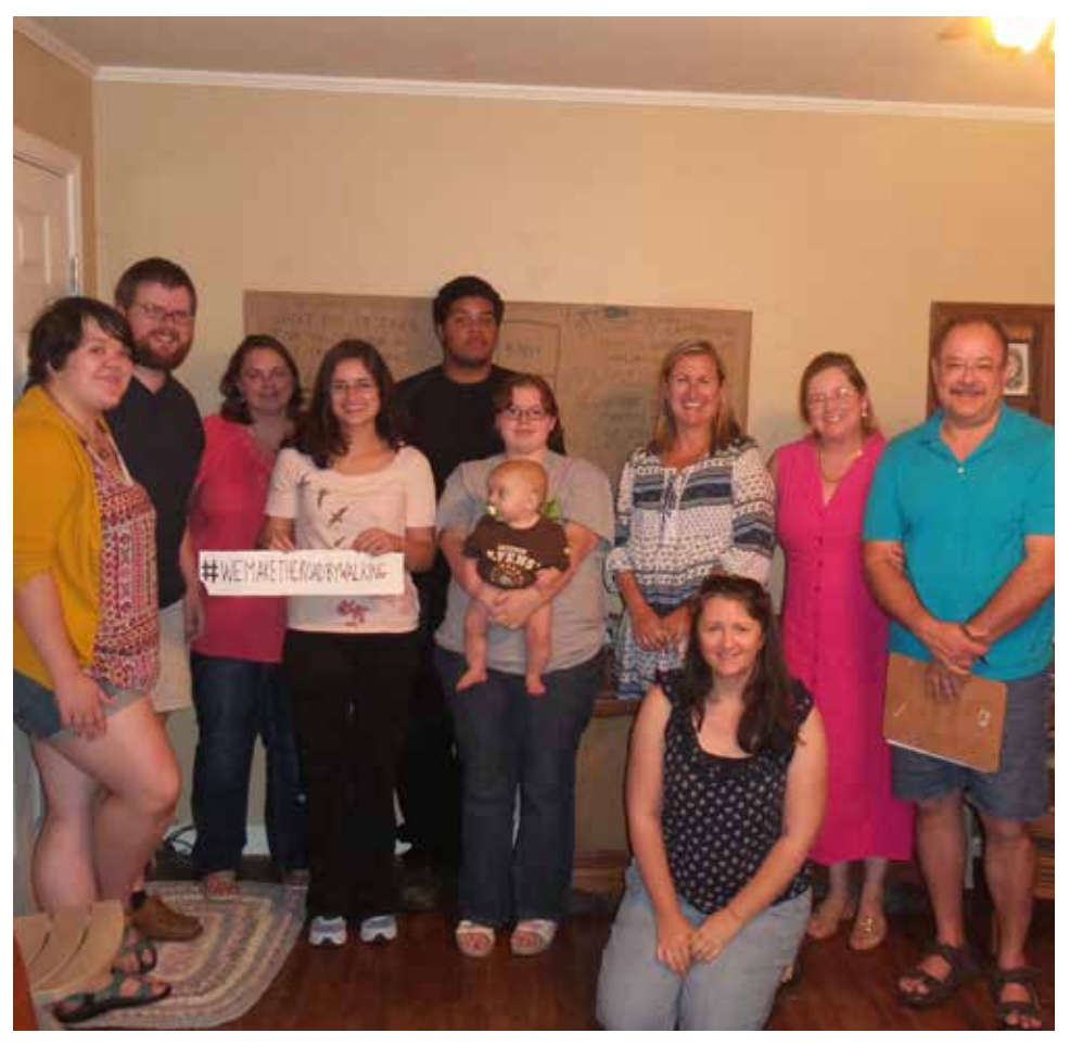
McElroy House Livingroom Conversation on Anti-Racism in Dardanelle, AR.

To the White Anti-Racists Who Are Nervous About Stepping Up Against Racism