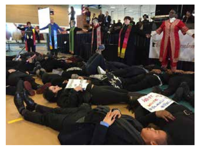
Die-in at Mall of the America, Twin Cities, MN.